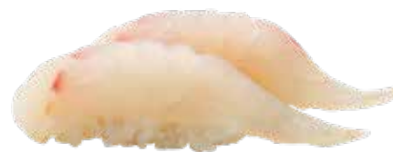
122 · TAI | € 3,50 Rice bites with sea bass 6 PIECES allergens: 4