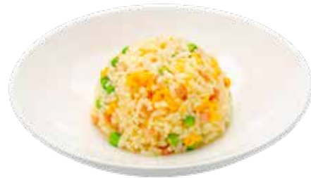
205 · CANTONESE-STYLE RICE | € 4,50 Fried rice with peas, cooked ham and eggs allergens: 1-3