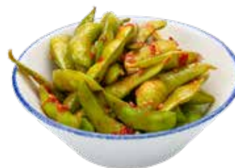
13 · EDAMAME SPICY | € 5,00 🌱🌶️ Spicy soybean pods and sesame seeds allergens: 6-10-11