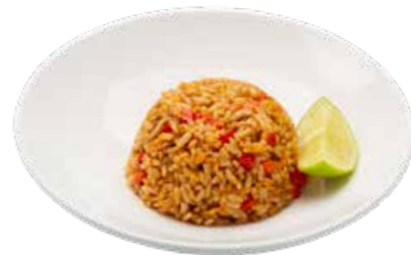
208 · RICE WITH MIHO SAUCE | € 6,50 Fried rice with Miho sauce, beef, eggs, peppers and onion allergens: 1-3-6-14