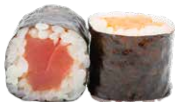
53 · HOSOMAKI MIXED | € 5,50 Small rice rolls wrapped in nori seaweed and filled with mixed fish 8 PIECES allergens: 4