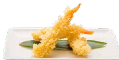
189 · EBI TEMPURA | € 12,00 Prawn tempura 4 PIECES allergens: 1-2-3