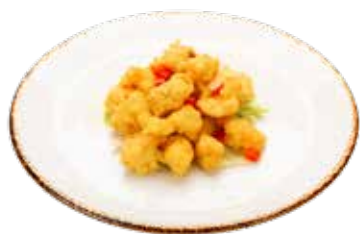
254 · CHICKEN WITH SALT AND PEPPER | € 7,00 🌶️ Crispy chicken breast with salt and pepper allergens: 1-3