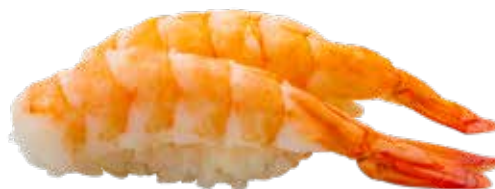
124 · EBI | € 3,50 Rice bites with cooked prawns 6 PIECES allergens: 2