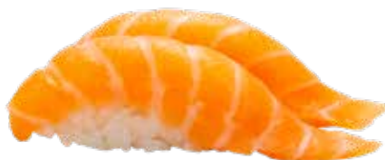
120 · SAKE | € 3,50 Rice bites with salmon 6 PIECES allergens: 4