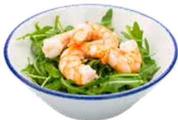
14 · SHRIMP COCKTAIL | € 6,00 Prawns with cocktail sauce 8 PIECES allergens: 1-2-3-4-6-10