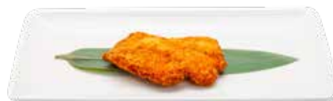
187 · PORK CUTLET | € 7,00 Breaded pork cutlet allergens: 1-3-6-11