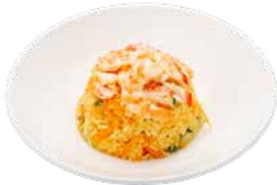
204 · KAISEN GOHAN | € 6,50 Fried rice with seafood, mixed vegetables and eggs allergens: 1-2-3-4-6-14