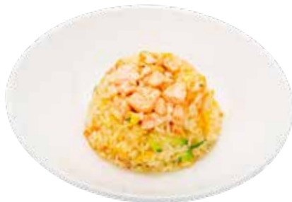
206 · FRIED RICE WITH SALMON | € 6,50 Fried rice with salmon, mixed vegetables and eggs allergens: 1-3-4