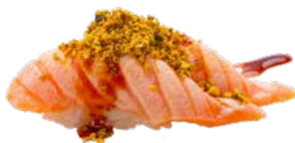
126 · FLAMBÉED SALMON WITH PISTACHIOS | € 4,50 Rice bites with seared salmon, pistachios and teriyaki sauce 6 PIECES allergens: 1-4-6-8-11