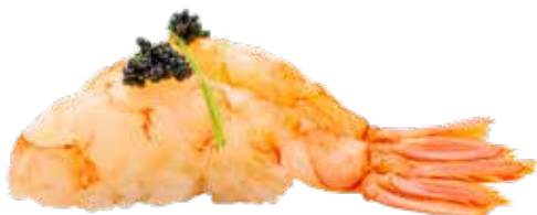
123 · AMAEBI | € 4,00 Rice bites with raw prawns and tobiko* 6 PIECES allergens: 1-2-4-6