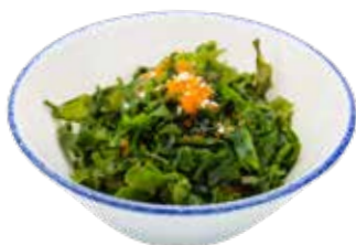
11 · WAKAME | € 4,50 🌿 Seaweed with sesame seeds allergens: 1-6-11