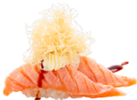
125 · FLAMBÉED SALMON AND PHILADELPHIA | € 4,50 Rice bites with seared salmon, Philadelphia cream cheese and teriyaki sauce 6 PIECES allergens: 1-4-6-7-11