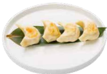
40 · GRILLED NIKU RAVIOLI | € 6,00 Ravioli with grilled meat and vegetables 4 PIECES allergens: 1-2-3-4-6-8-9-10-12-14