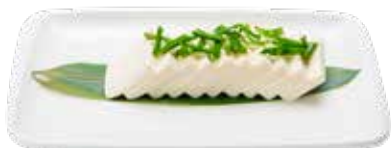
09 · TOFU | € 3,00 🌿 Tofu with soy sauce allergens: 1-6