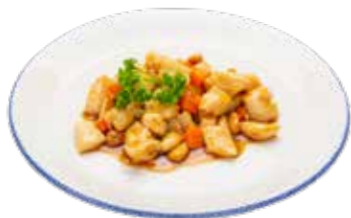
252 · CHICKEN WITH ALMONDS | € 6,50 Sautéed chicken breast with almonds and carrots allergens: 1-3-6-8-14