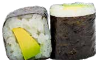
51 · HOSOMAKI AVOCADO | € 4,50 Small rice rolls wrapped in nori seaweed and filled with avocado 8 PIECES allergens: /