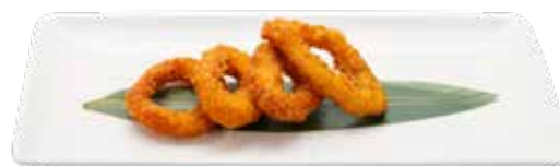
198 · IKA KARAGA | € 8,00 Fried squid rings 8 PIECES allergens: 1-3-14