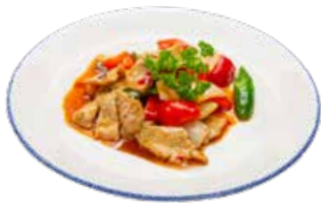
247 · SPICY BEEF | € 7,00 🌶️🌶️ Beef sautéed with chilli pepper and chives allergens: 1-3-6-14