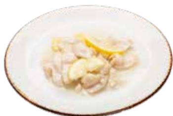
256 · LEMON CHICKEN | € 6,50 Sautéed chicken breast with lemon sauce allergens: 3