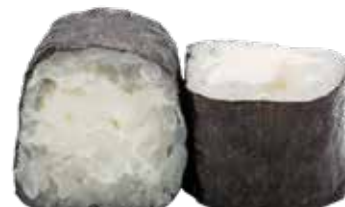
52 · HOSOMAKI PHILADELPHIA | € 4,00 Small rice rolls wrapped in nori seaweed and filled with Philadelphia cream cheese 8 PIECES allergens: 7