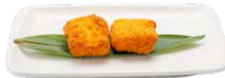
04 · SALMON CROQUETTES | € 5,00 Crispy salmon and potato balls 4 PIECES allergens: 1-3-4-6-7