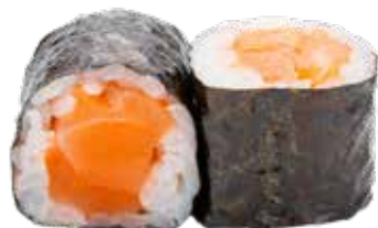
50 · HOSOMAKI SAKE | € 5,00 Small rice rolls wrapped in nori seaweed and filled with salmon 8 PIECES allergens: 4