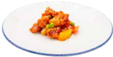
241 · SWEET AND SOUR PORK | € 6,50 Pork in sweet and sour sauce allergens: 1-3