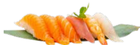
132 · NIGIRI MIX | € 6,50 Rice bites with mixed fish 6 PIECES allergens: 1-2-3-4-6-8-10