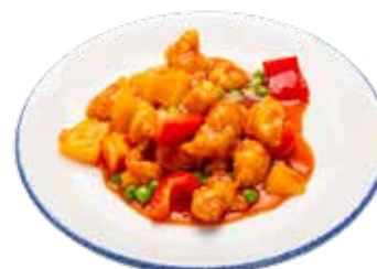
255 · SWEET AND SOUR CHICKEN | € 6,50 Sautéed chicken breast with sweet and sour sauce allergens: 3-6