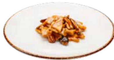
248 · BEEF WITH MUSHROOMS AND BAMBOO | € 7,00 Beef sautéed with mushrooms* and bamboo shoots allergens: 1-3-6-14