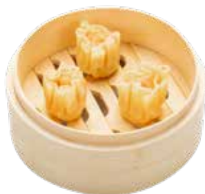
35 · RAVIOLI SHUMAY | € 6,50 Ravioli with prawns, meat, vegetables and lard 4 PIECES allergens: 1-2-3-4-6-9-11-12-14