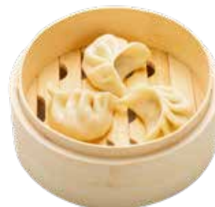
34 · RAVIOLI NIKU | € 5,50 Ravioli with meat and vegetables 4 PIECES allergens: 1-2-3-4-6-8-9-10-12-14