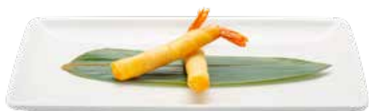
195 · EBI STICK | € 7,00 Crispy fried prawn roll with special sauce 4 PIECES allergens: 1-2-3-7