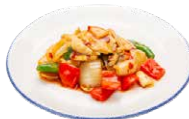
253 · SPICY CHICKEN | € 6,50 🌶️ Sautéed chicken breast with vegetables and spicy sauce allergens: 1-3-6-14