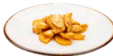
257 · CHICKEN WITH POTATOES | € 6,50 Sautéed chicken breast with potatoes allergens: 1-3-6-14