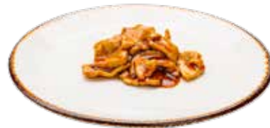
246 · SAUTÉED BEEF WITH OYSTER SAUCE | € 7,00 Sautéed beef with oyster sauce allergens: 1-3-6-14