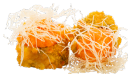
55 · HOSOMAKI SPICY SALMON | € 9,00 Small rice rolls wrapped in nori seaweed, fried and filled with salmon, salmon tartare, teriyaki sauce, kataifi and tobiko* 8 PIECES allergens: 1-3-4-6-7-10-11