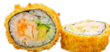
56 · HOSOMAKI NIDO | € 9,00 Small rice rolls wrapped in nori seaweed, fried and filled with salmon, garnished with Philadelphia cream cheese, kataifi and teriyaki sauce 8 PIECES allergens: 1-3-4-6-7-11