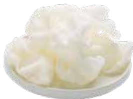
06 · PRAWN CRACKERS | € 2,50 Crunchy tapioca chips and seafood allergens: 1-2