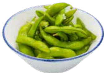
12 · EDAMAME | € 4,50 🌱 Soybean pods allergens: 6