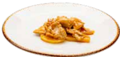
249 · BEEF WITH POTATOES | € 7,00 Beef with potatoes allergens: 1-3-6-11-14