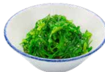
10 · GOMA WAKAME | € 4,50 🌿🌶️ Spicy seaweed allergens: 1-6-11