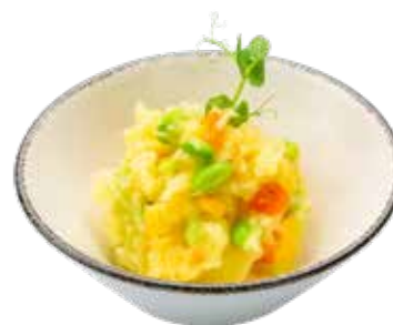
15 · POTATO SALAD | € 7,00 🌱 Steamed potato salad with carrots, sweetcorn, edamame beans and mayonnaise allergens: 3-6-8