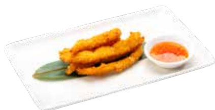
185 · TORIKARAGE | € 6,00 Fried chicken nuggets 5 PIECES allergens: 1-3-6-7-11